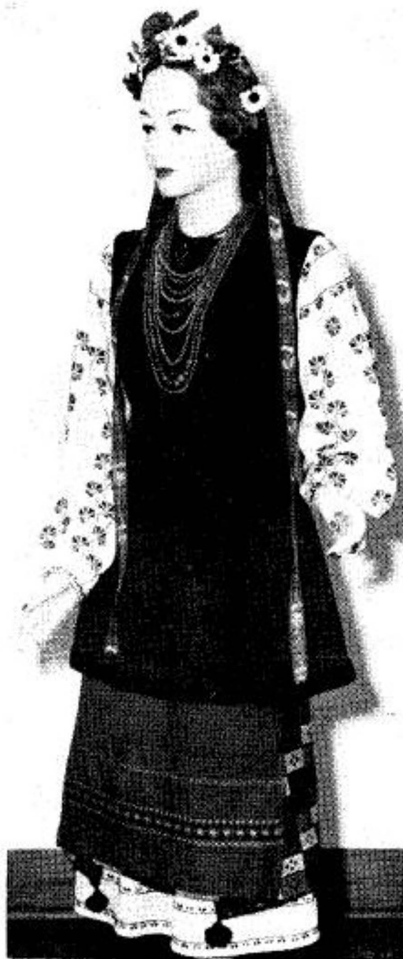
MUSEUM — Girl in costume in Poltava style