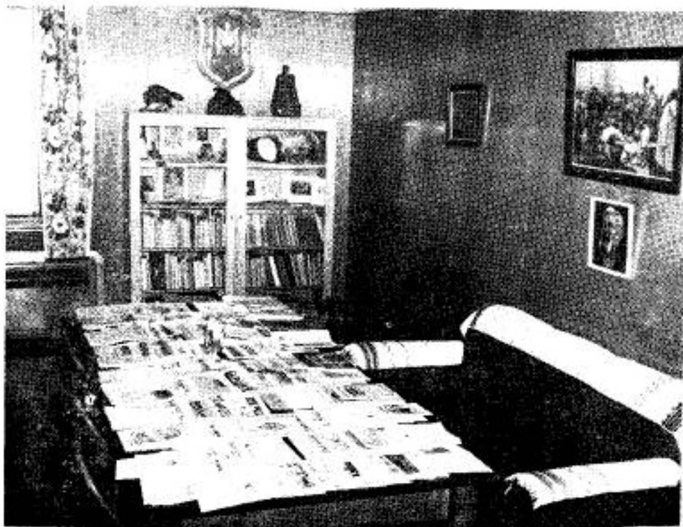
Section of reading room of the Centre

The second world war hastened the realization of this idea. From 1941 to 1944 the Germans were in possession of all those lands in which Ukrainians libraries, museums and archives had been built up through the years containing many valuable historical items. These treasures were removed by the Germans, from institutions in Berlin, Paris, Prague, and Warsaw. Most of them disappeared without a