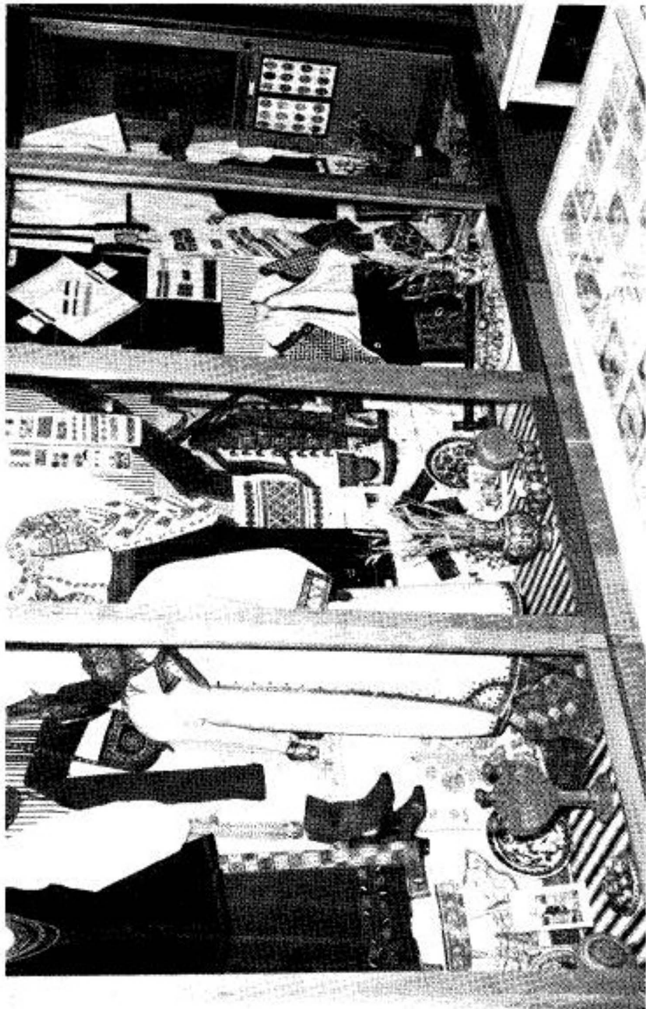
MUSEUM — Another section of case containing folk art