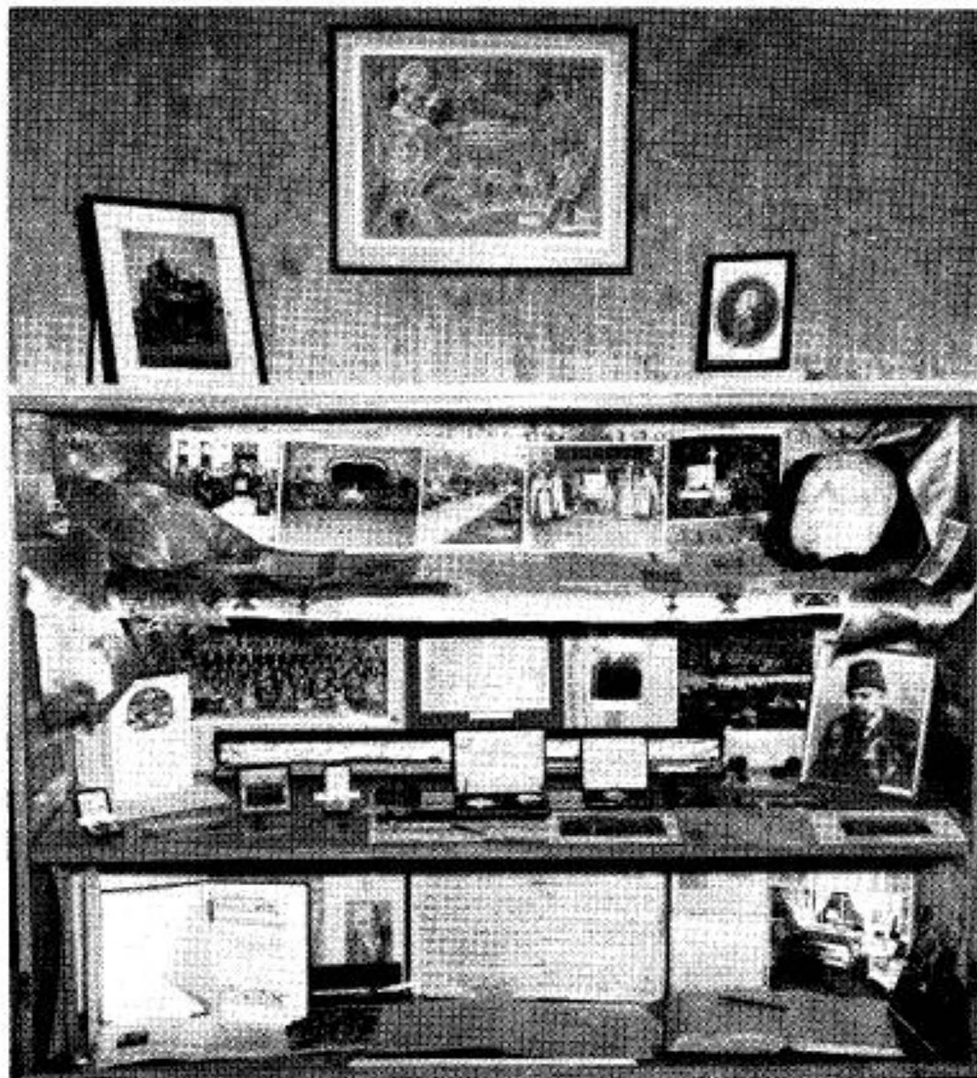
MUSEUM — Case with articles of musical career of A. Koshetz