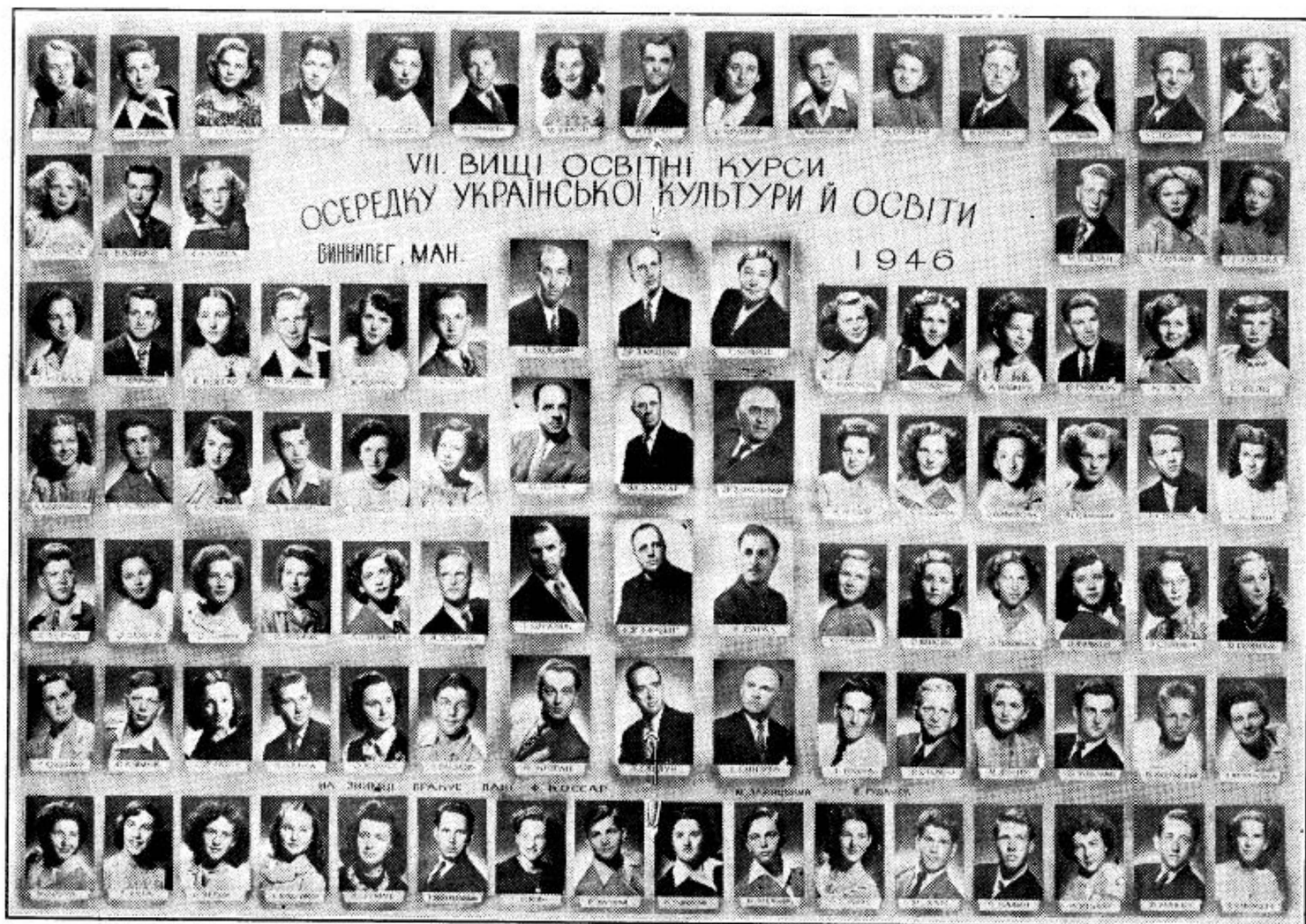
Tableau. Ukrainian Summer School 1946. Winnipeg, Man.