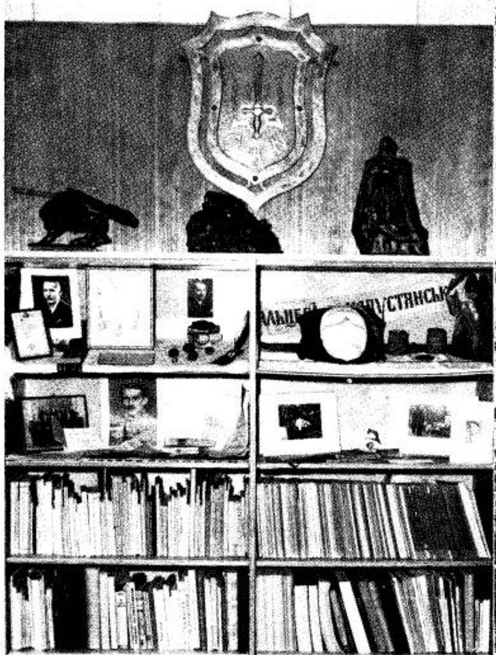
Case with personal articles and library of Col. E. Konovaletz