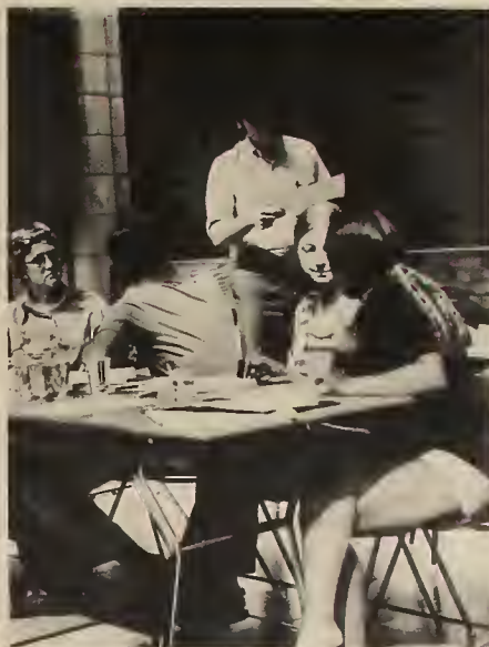
"Whadya mean 2 plus 2 equals 4!"