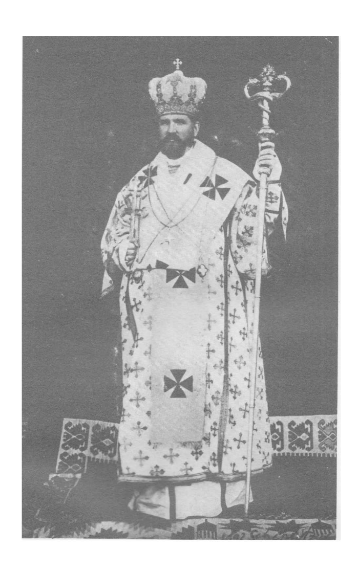
Metropolitan Andrew before the First world war - 1914.