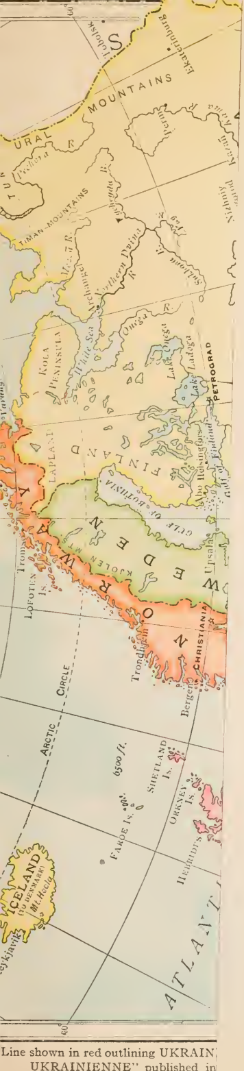
Line shown in red outlining UKRAIN UKRAINIENNE" published in 1897, F. 2. P. 150, and fro