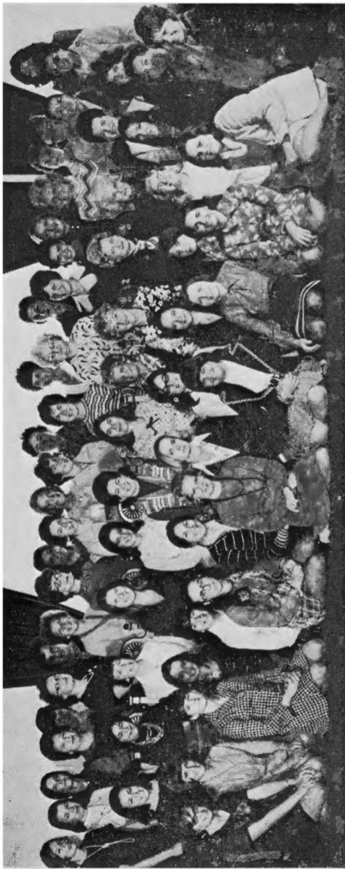
ALPHA OMEGA WOMEN'S ALUMNAE AT MEMBERSHIP LUNCHEON — September 23rd, 1973.