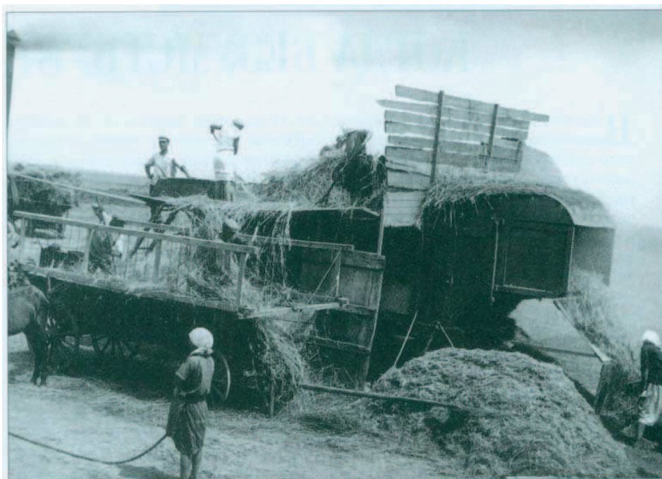
Молотьба на колхозном поле. Днепропетровская область. 1933 г.