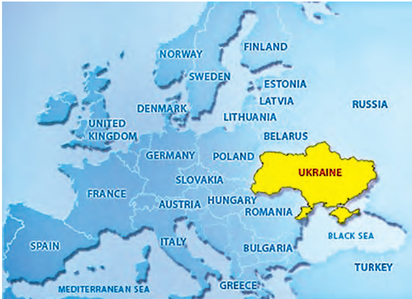
Map of Europe

On August 23, 1939, the Soviet Union entered an agreement with Nazi Germany (Molotov-Ribbentrop Pact), and they became allies. As a result of this agreement, Stalin and Hitler partitioned Poland and divided eastern Europe into their spheres of influence. This led to the Nazi invasion of Poland on September 1, 1939, and subsequent declaration of war by the United Kingdom and France, thus beginning WWII.