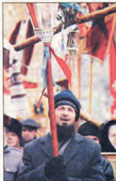
Ukrainians carry crosses decorated with Prime Minister Viktor Yanukovich's blue campaign ribbons during a religious procession in Kiev this week.