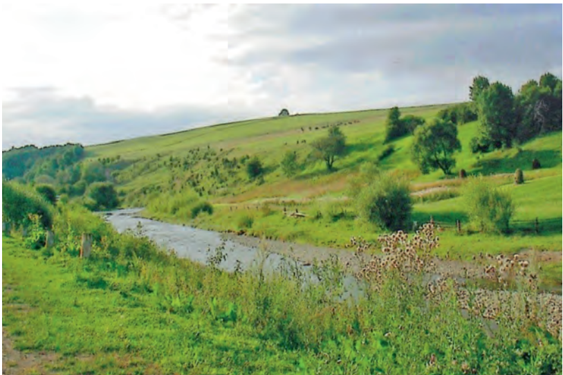
Dnister River in Strilky

Strilky and Topilnytsia are very picturesque villages in the Subcarpathian region near the town of Stryi Sambir. The Dnister River flows through Strilky and occasionally there were floods in spring time, which caused great damage. During the summer we used to whiten the homespun fabric in the river.