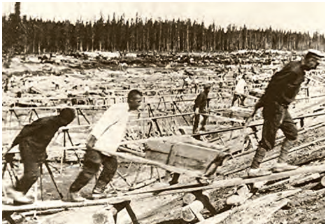
Gulag – Soviet Slave Labor Camp

That night they took my uncle and his family to Siberia. We never saw or heard from his family again. That same night they took thousands of Ukrainians who suffered a similar fate. They were shipped to the gulags, where most of them perished from lack of food, shelter, and from slave labor.