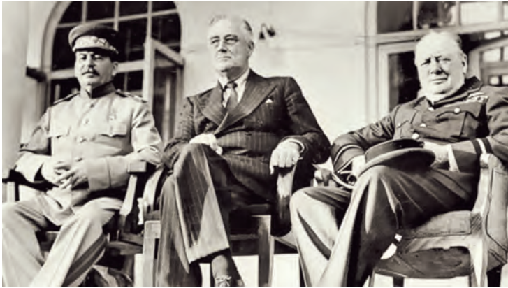
Stalin, Roosevelt, Churchill at the Yalta Conference

We felt that we had finally overcome all the obstacles and were now safe. But it wasn't so. We had to overcome one more hurdle – the forced repatriation to the Soviet Union.