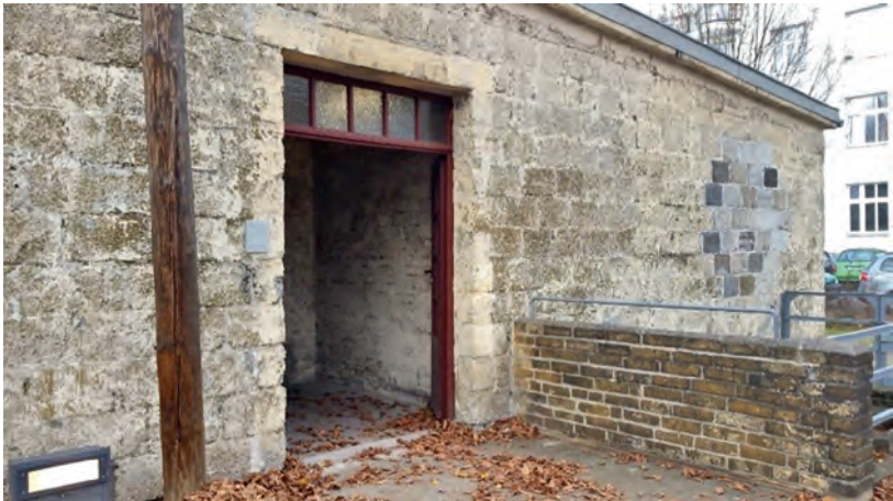
One of the Pertrix forced labor camps part of the Nazi Forced Labor Documentation Center