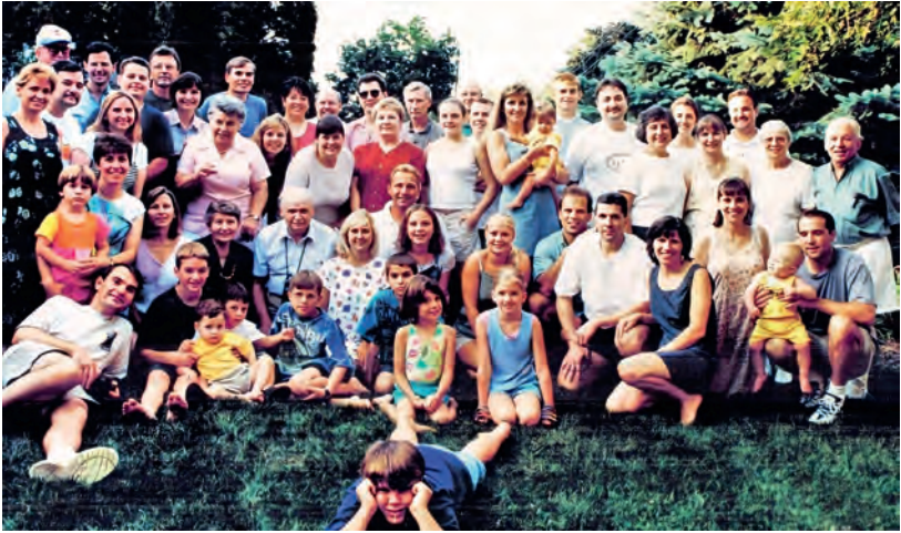
Kocur Family Reunion July 25, 1998

My family, my brother's, and both my sisters' families are thriving in the United States. We are a close-knit family and throughout the years we frequently got together to celebrate family occasions. In 1998 we held a Kocur family reunion with over 60 family members attending.