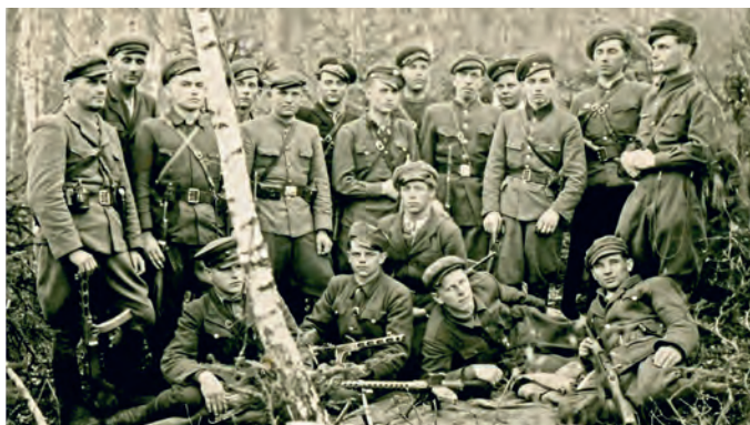
UPA Soldiers in the forest

Young people tried to find a way to avoid being taken to Germany as forced laborers. Many of them joined the Ukrainian Insurgent Army (UPA), which was formed in 1942 and fought against both the Nazis and the Soviets.