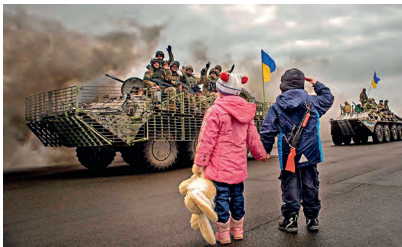
Children salute Ukrainian Soldiers

History does not have to repeat itself. We can stop Russia and we must stop Russia, a state sponsor of terror. As Martin Luther King states, “A threat to justice anywhere is a threat to justice everywhere.”