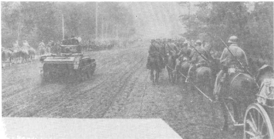
Soviet troops pouring into Western Ukraine Sept. 17, 1939.

America is doing its share to treat Stalin as a possible miscreant who may yet be made to see the light (but not, presumably, so long as 1,000,000 Germans are concentrated in East Europe). The Welles school of thought, attributed to Under-Secretary of State Sumner Welles, is that Russia can be bought off sooner or later. While this theory prevails