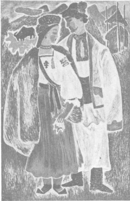
CARPATHO-UKRAINIANS National costume.

The present status of the Ukrainian people in their native land under foreign oppressors is one of the most tragic in the world. More than 97 per cent of them are under Soviet rule. The other 3 per cent are scattered over Europe, in fact, throughout the world. More than half a million of them are found in Carpatho-Ukraine, which is now under Hungarian occupation. It is to the plight of these people, sometimes referred to as Ruthenians, 2 that the writer wishes to call the attention of the civilized world.