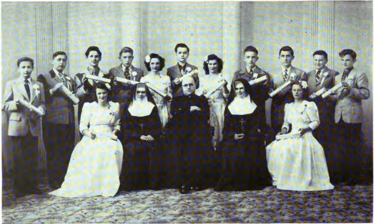
THE FIRST GRADUATING CLASS OF JUNE 2, 1946 WITH THEIR PASTOR AND SISTERS, DETROIT, MICH.