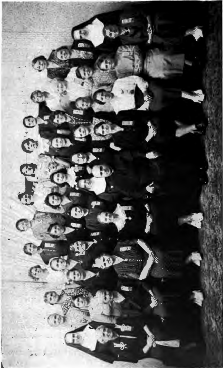
APOSTLESHIP OF PRAYER AT ST. JOHN THE BAPTIST CHURCH, DETROIT