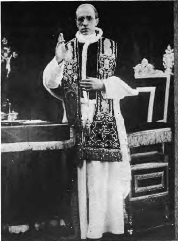
СВЯТИШИЙ ВСЕЛЕНСЬКИЙ АРХІЄРЕЙ ПІЙ ХІІ Наслідник Св. Петра Видимий Голова Церкви Христової GLORIOUSLY REIGNING PONTIFF, POPE PIUS XII, the 262nd successor of St. Peter