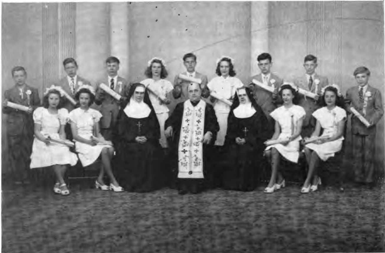
THE GRADUATING CLASS OF ST. JOHN'S UKRAINIAN CATHOLIC SCHOOL JUNE 8, 1947 with their Very Rev. Pastor Jubilarian and Sisters Servants of Mary Immaculate, Detroit, Michigan