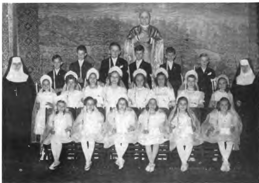
FIRST HOLY COMMUNION JUNE 1947 at St. John's Ukrainian Catholic Church, Detroit