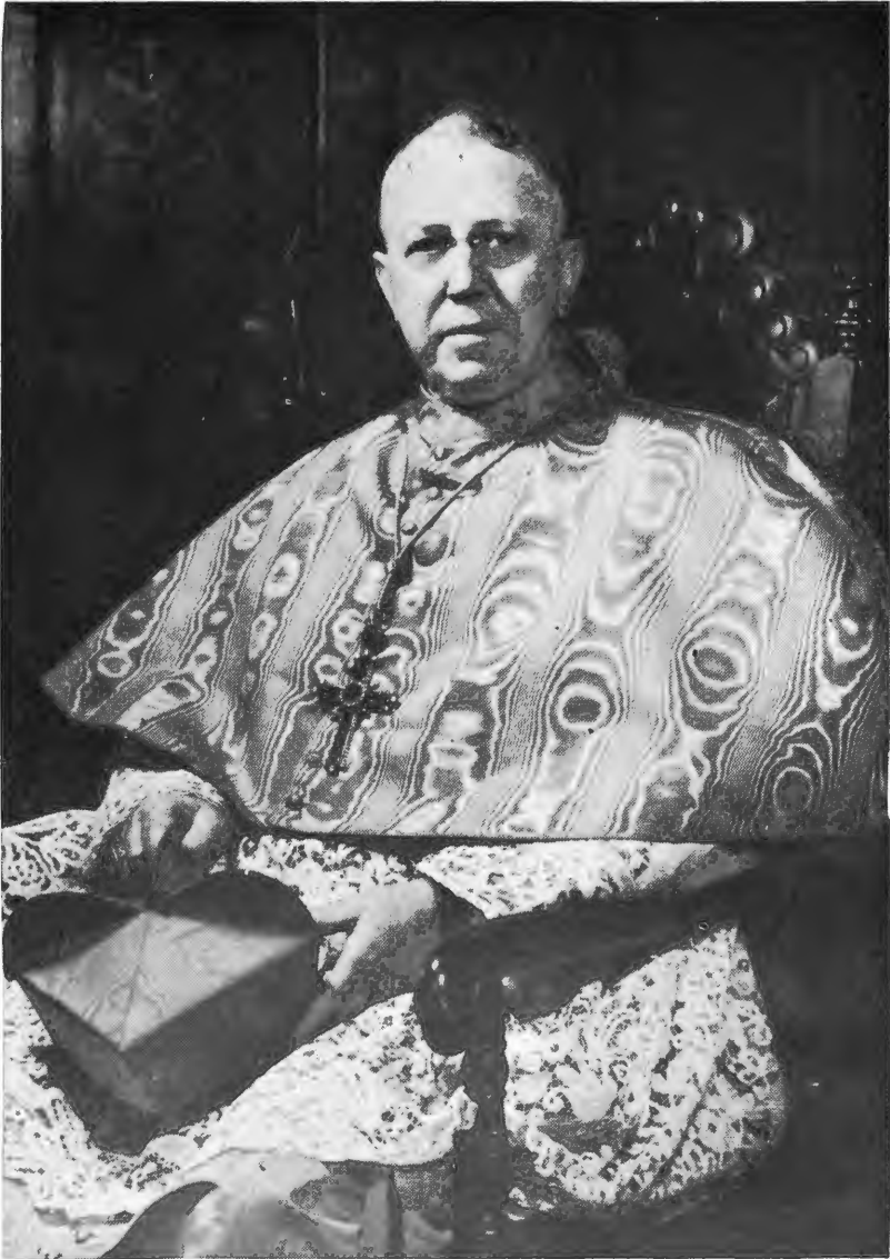
HIS EMINENCE, EDWARD CARDINAL MOONEY, Archbishop of Detroit