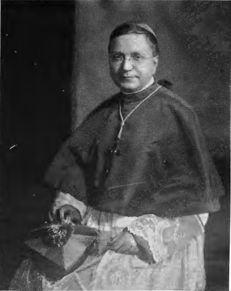
HIS EXCELLENCY THE MOST REV. AMLETO GIOVANNI CICOGNANI, D.D. Apostolic Delegate