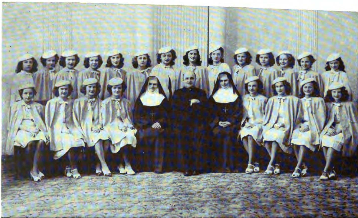
THE SODALITY OF THE BLESSED VIRGIN MARY, OF ST. JOHN'S UKRAINIAN CATHOLIC CHURCH, DETROIT, MICH.