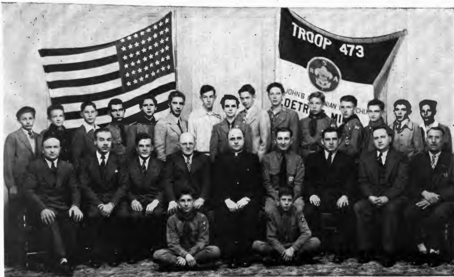
UKRAINIAN CATHOLIC BOY SCOUTS OF AMERICA OF ST. JOHN'S UKRAINIAN CATHOLIC CHURCH, DETROIT, MICH., with their Pastor, Scout Master, and Scout Committee