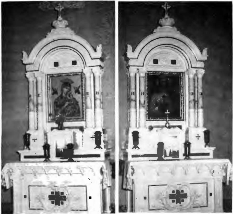
SIDE ALTARS IN ST. JOHN'S CHURCH, DETROIT, MICH.