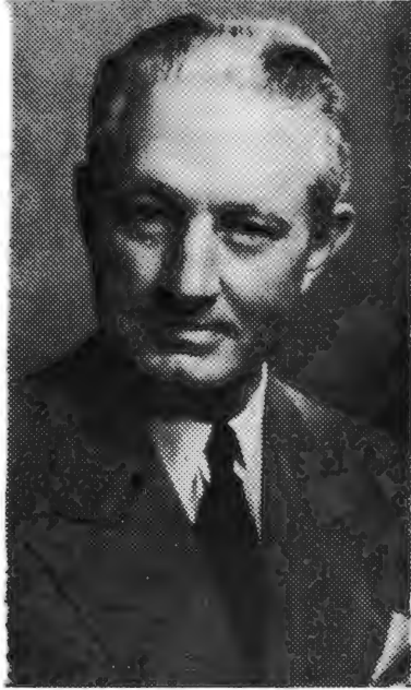
KIM SIGLER, Governor