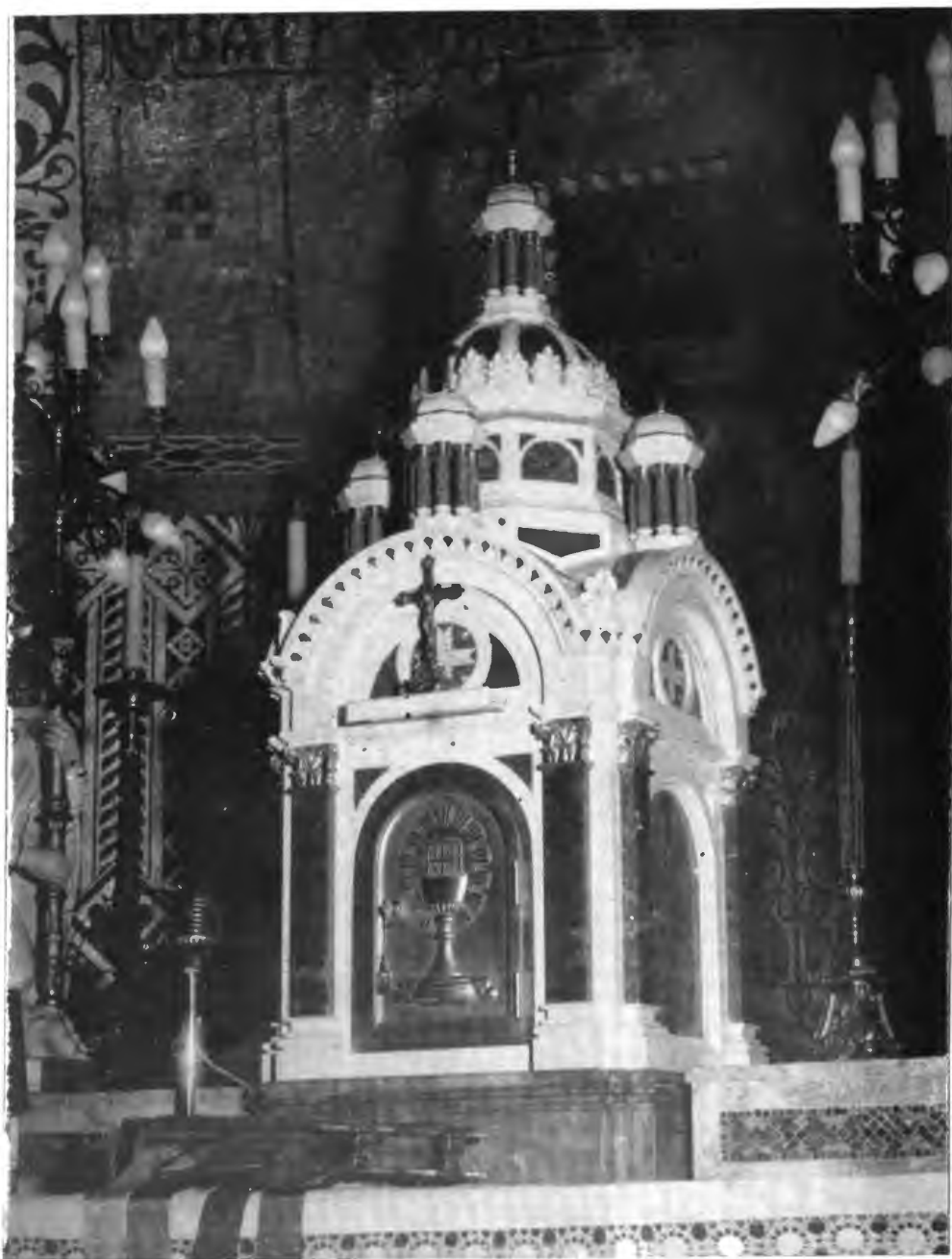
THIS OUTSTANDING BEAUTIFUL TABERNACLE — the Home of Our Lord in the Blessed Sacrament — is built in the miniature form and style of a Ukrainian Church — of white Carrara marble, Sienna Brocatelli marble, Regalio Brazilian onyx, mosaic and gold with steel safe. This exquisite masterpiece was created by Dapartio Studios, Chicago, 1944.