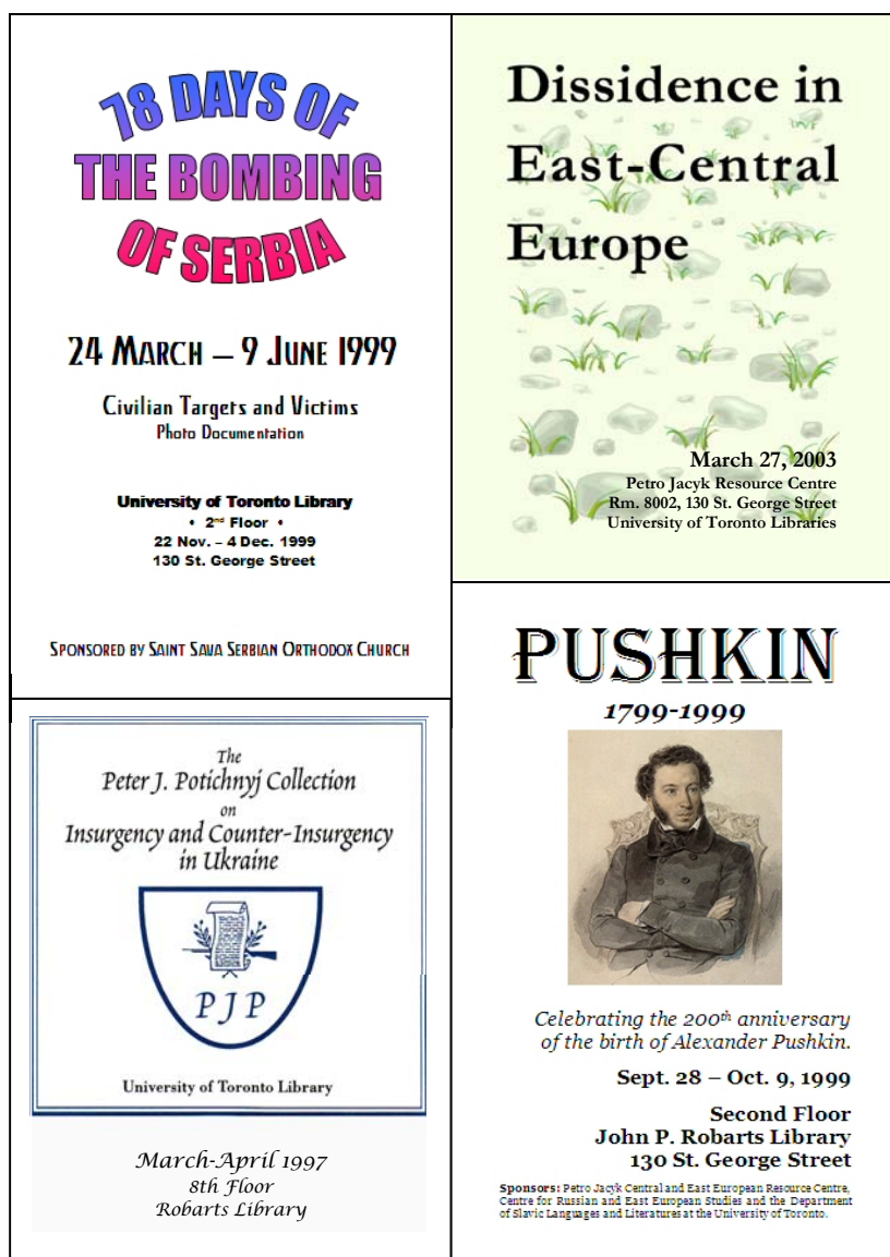
Posters from various exhibitions and events.