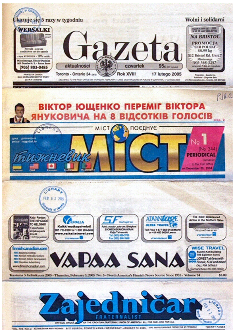
Four of the community newspapers received 'gratis' at PJRC.

casts from other countries in Eastern Europe. There have also been dealings and exchanges of books and information with Canadian diplomatic missions in Eastern Europe and the CIS. Funding is also being sought for the compilation of an index to the large microfilm holdings of the Peter J. Potichnyj Collection on Insurgency and Counter-Insurgency in Ukraine .