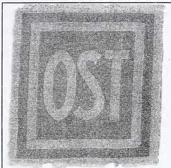
Fig. 3. Ostabzeichen (East badge) worn by Soviet Ukrainian and other Soviet labourers from February 1942 until approximately June 1944

Ukrainians did not have to wear identifying badges, a recognition of their privileged position versus ethnic Polish and Soviet workers. “At a time when all Jews and inmates