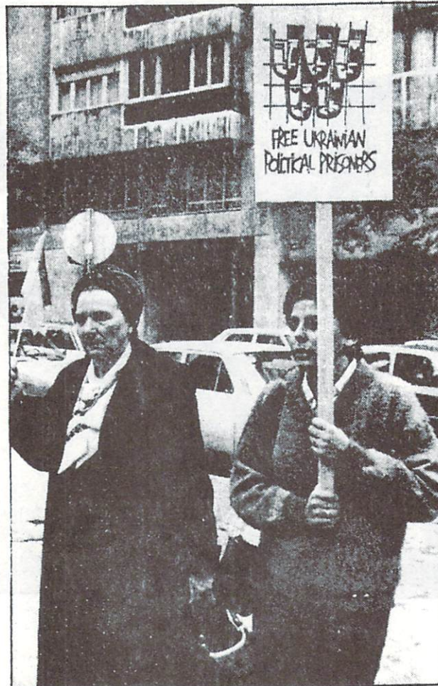
Por la libertad de los ucranianos.