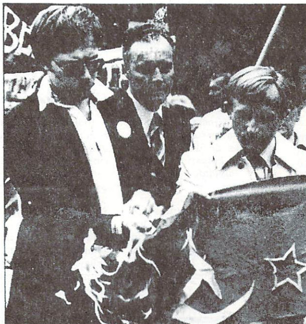
Disidentes letones queman una bandera de la U.R.S.S. ante la sede de la Conferencia de Madrid.