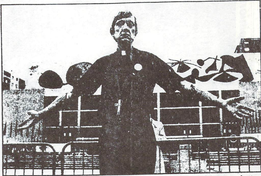
Con los brazos en cruz y con la cruz en pecho, este religioso se cortó las venas frente al Palacio de Congresos y Exposiciones, sede de la Conferencia de Madrid, en un acto simbólico de protesta universal contra la opresión soviética en su país, Letonia.