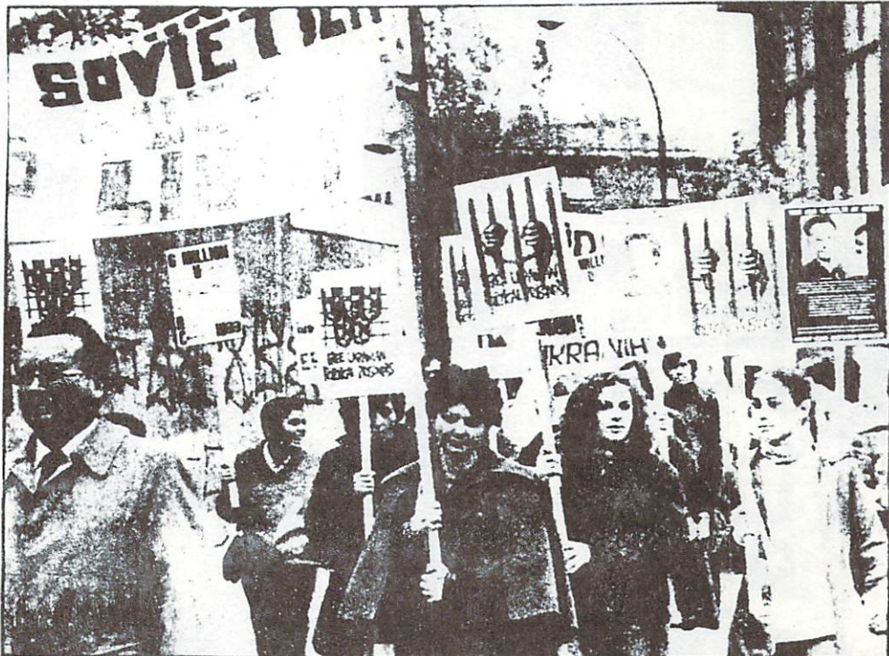
«Seis millones de ucranianos, desde 1933, prisioneros de la Urss», dicen las pancartas de estos manifestantes ante la Conferencia de Madrid. Los pueblos y los hombres no se resignan a vivir bajo la tiranía.