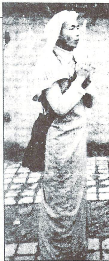
Un pacifista japonés, en las cercanías del Palacio de Congresos.

Desde la plaza de los Sagrados Corazones, esquina al estadio Santiago Bernabéu, un grupo de unas cuarenta personas, que manifestaron pertenecer al Bloque Antibolchevique de Naciones (ABN), se dirigieron en manifestación hacia el palacio donde se celebra la Conferencia Europea. Bajo el lema «Libertad para todas las naciones,