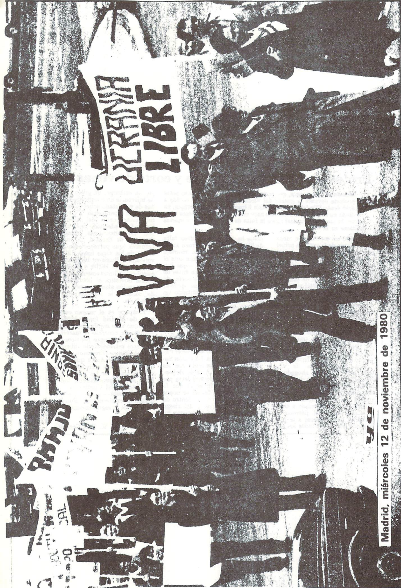
Madrid, miércoles 12 de noviembre de 1980