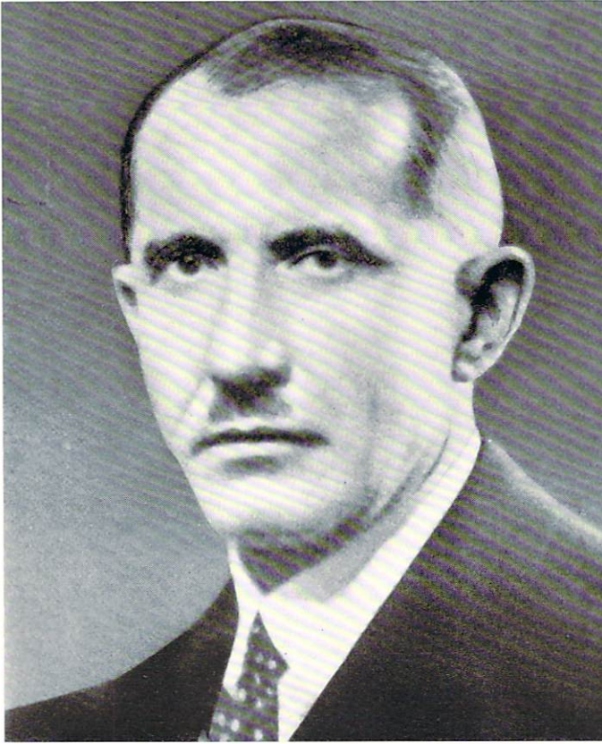
Evhen Konovalts (b. 14. 6. 1891, d. 23. 5. 1938) Colonel, Commander-in-Chief of the "Sichovi Striltsi" corps of the Ukrainian Army; founder and head of the Ukrainian Military Organization (UVO) and of the Organization of Ukrainian Nationalists (OUN); murdered by an NKVD agent in Rotterdam.