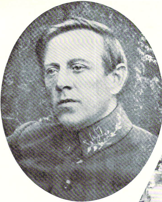
Symon Petlura (b. 23. 5. 1879, d. 25. 5. 1926) President of Ukraine and Supreme Commander of the Ukrainian forces; mur- dered by the Russian agent Schwarzbart in Paris.