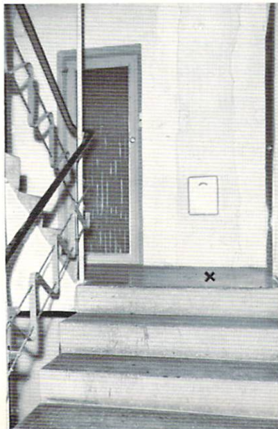
Munich —Kreittmayrstrass No. 7, the house in which Stepan Bandera lived.