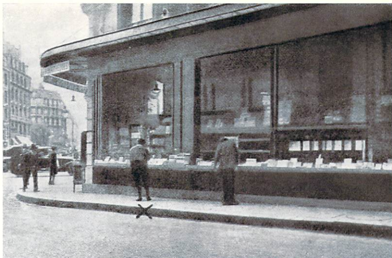
Paris — The corner of Rue Racine and Bd. St. Michel, where Symon Petlura was murdered.