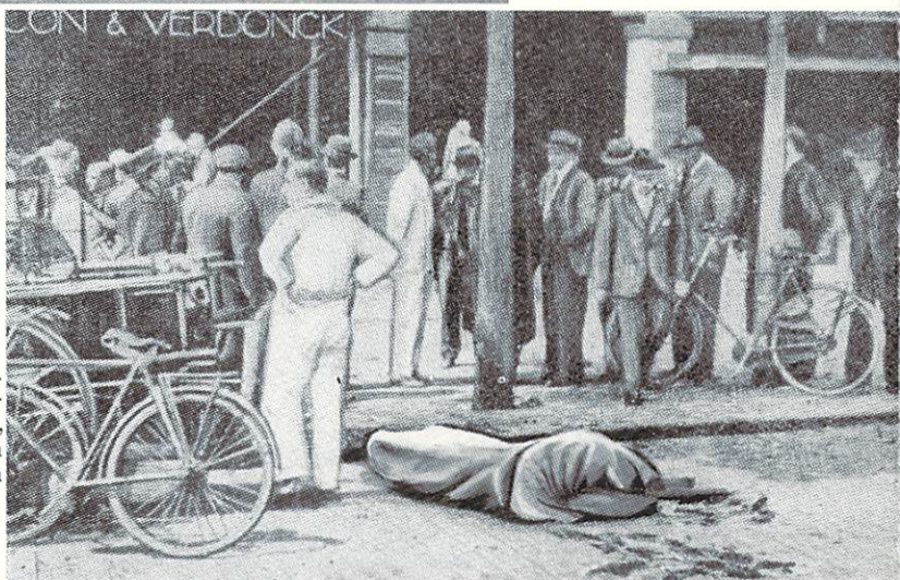
Rotterdam — Koolsingel. The mutilated body of Colonel Evhen Konovalts, who was murdered by a bomb planted by a Russian agent.