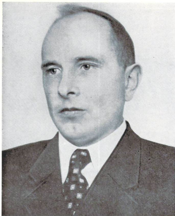
Stepan Bandera (b. 1. 1. 1909, d. 15. 10. 1959)

Leader of the Organization of Ukrainian Nationalists (OUN) from 1940-1943 and from 1945-1959; 1941-1944 interned in a Nazi concentration camp; murdered by a KGB agent in Munich.