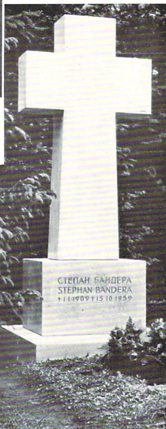
Stepan Bandera's Grave in the Waldfriedhof, Munich