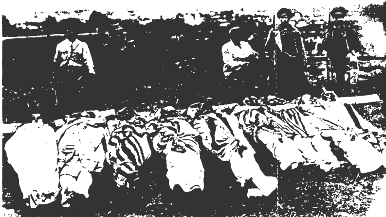
Above) Russian Cossacks standing over the bodies of their victims. The outbreak of pogroms in the 1880's led to mass Jewish emigration from Eastern Europe.