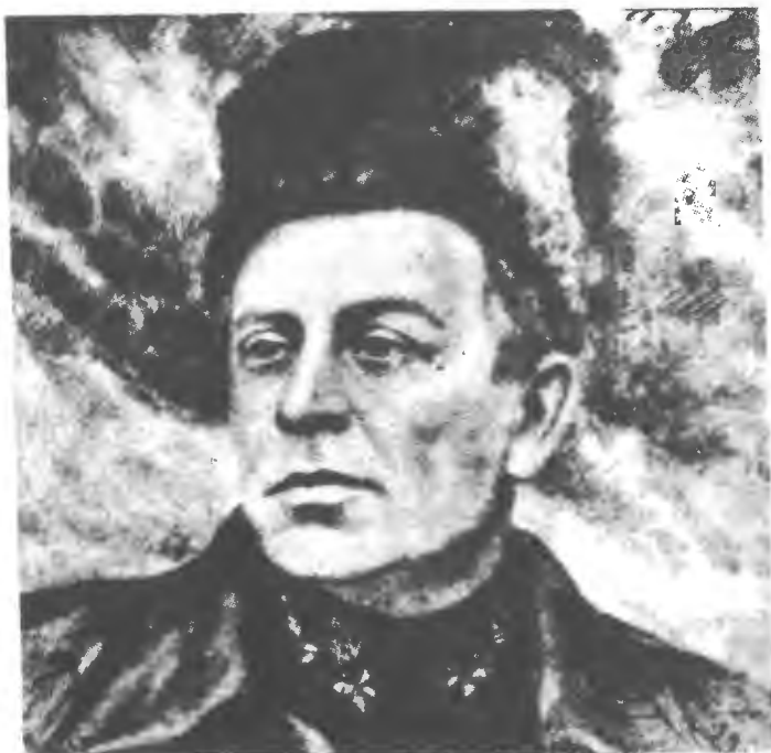
Chief Otaman Simon Petlura (1880-1926)

Simeon (Simon) Petlura is the victim of a double murder. The first was physical, in that he was shot to death in Paris by a Bolshevik agent, the Jew Szwartzbart, who supposedly acted in the role of avenger for "crimes against the Jewish people". The second is murder by defamation, since till this very day the Jews besmirch Petlura as a "bloody murderer of Jews". And yet, there is no concrete evidence that Petlura participated in, directed or instigated any pogroms against the Jews. On the contrary, as Supreme Commander of the Ukrainian Armed Forces, he issued a special directive to all soldiers of the Ukrainian National Republic, ordering them to refrain from any pogroms and to avoid provocations to pogroms against Jews. What is more, he was responsible for the adoption of a clause into the Ukrainian Constitution, granting widespread autonomy to the Jewish minority of Ukraine — something Jews enjoyed nowhere else in the world.