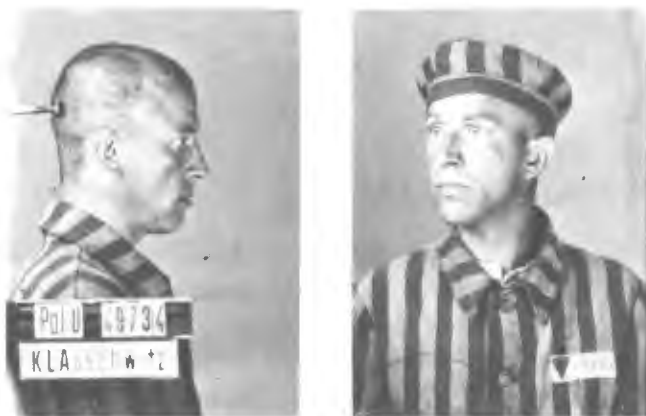
The author on arriving in the concentration camp at Auschwitz, July 1942

January 19, 1945). His experience in the Nazi concentration camps he describes in his IN THE GERMAN MILLS OF DEATH (Vantage Press, 1976).