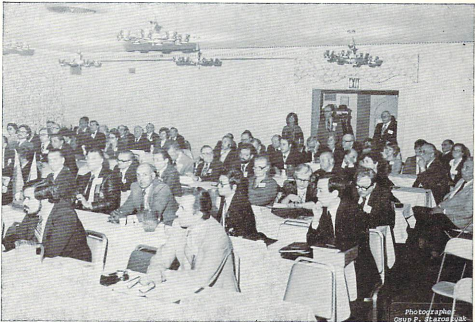
View of the plenary session of the AF ABN Congress, May 2.

The geopolitical situation of Poland is without any doubt better than that of