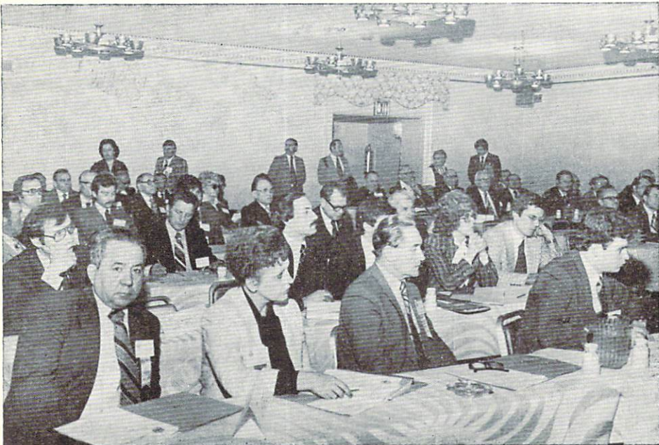
View of the plenary session of the AF ABN Congress, May 2.

Our demands are not simply the demands of our respective emigré communities, but rather they emulate the demands of those who are on the first front of the struggle. During the uprisings in the concentration camps of Siberia already