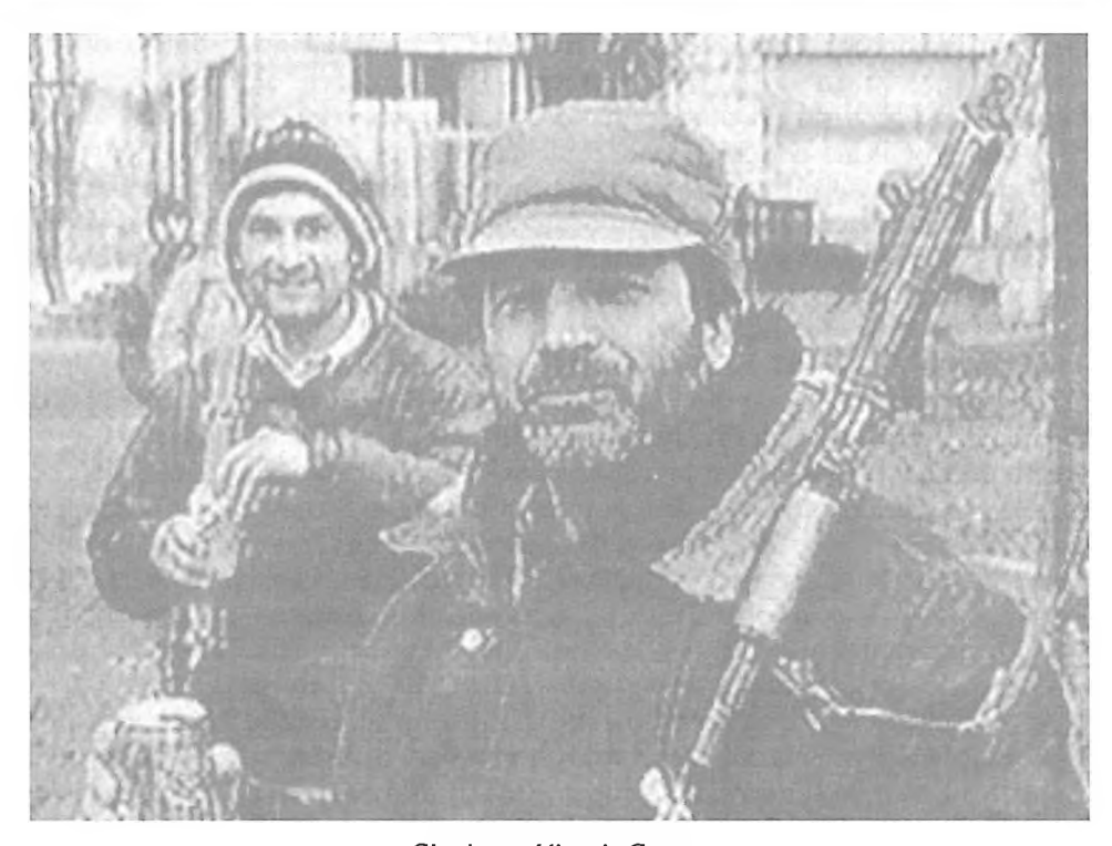
Chechen soldiers in Grozny

It is my considered view as well, that the historical progressive forces in the internal Russian Empire are moving forward to reassert their national right to sovereignty and independence. This process will continue to build in momentum, just as was the case in the former satellite countries and subsequently in the republics of the former USSR. It can also be expected that Moscow will not quietly accept this turn of events and will resort to all means at its disposal, including use of force, to prevent the total disintegration of its Internal Empire. The question that remains is what if anything the West will be prepared to do if such developments come to pass. Regrettably, based on past actions, I cannot hold out hope that the industrialised democracies will stand with the subjugated nations of the Internal Russian Empire. This is yet another convincing argument as to the need for a dynamic organisation, which the ABN is, to speak out forcefully in defense of the national rights of the countries in the Internal Russian Empire struggling to achieve their independence.