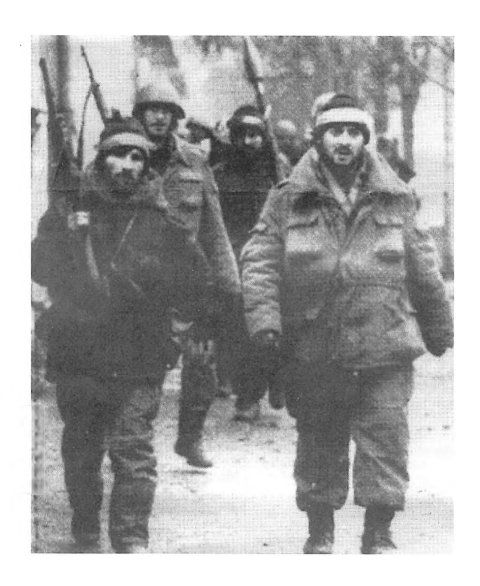
Chechen soldiers fighting for national independence against the invasion of Russian troops near the Chechen capital of Grozny.