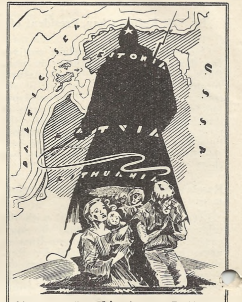
Martyro are calling: "West, destroy the Red Cyranny in East, before it destroys you!"

A postcard spreaded by the emigration of Baltic Nations