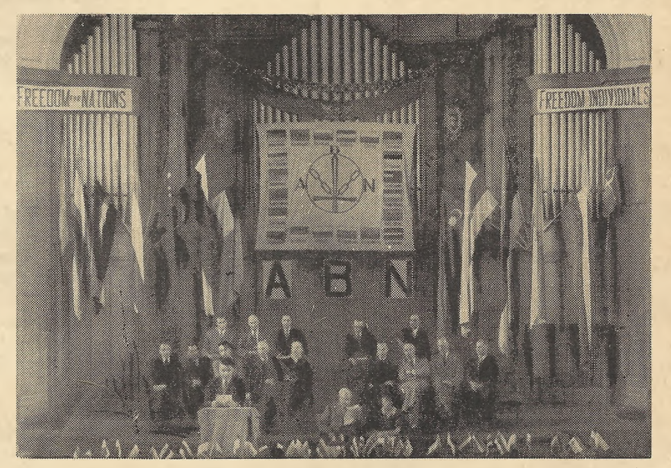
Presidency of the Convention in Edinburgh

until the oppressed peoples in the tremendous Russian Imperium are once (Continued on Page 2)