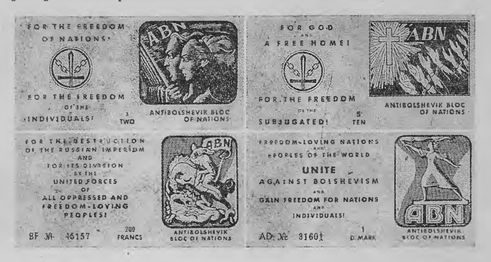
The Jetons issued by the ABN for the "Liberation Fund of the Subjugated Peoples"

The programme of the Anti-Bolshevik-Bloc of Nations (ABN) points the