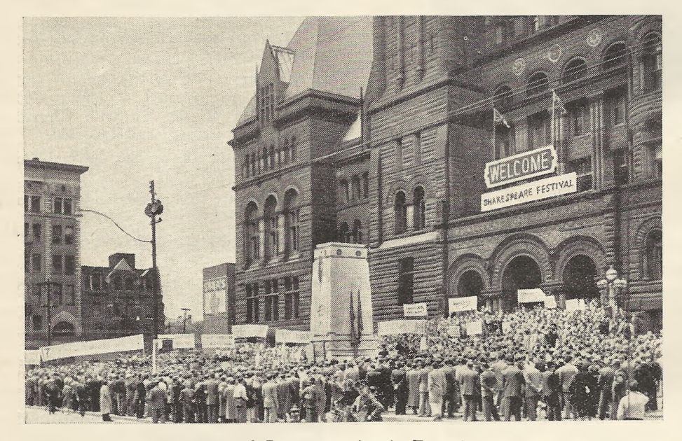
A.B.N.-Demonstration in Toronto

The struggle in the Ukraine and other satellite states is being fought without the participation of the outside world. People there are convinced that there is no sense in joining the anti-Communist front in the West, if this front does not take its the pilgrimages to Moscow, the dispute about