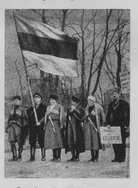
Cossacks at the ABN-Demonstration in Munich

At the outbreak of the revolution in the year 1917 the Cossacks still preserved some remnants of their autonomic rights and did not mingle with the population of other parts of the Empire. This fact explains why in 1917 the Cossacks with such easiness transformed their ancient autonomy into a democratic rule based on the will of a self-governing state. At the