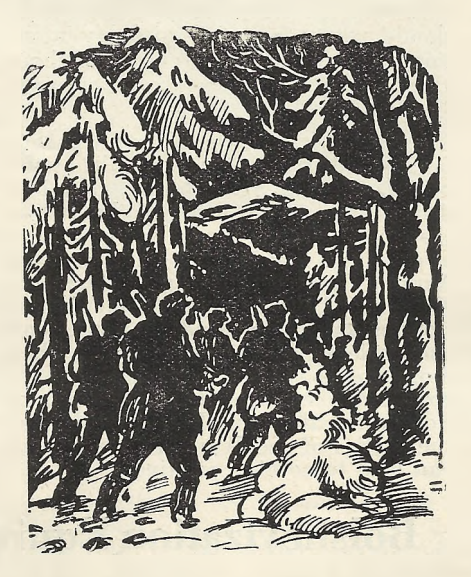
The fighters for freedom behind the Iron Curtain

quiet, when we must live in exile and think constantly of our home enslaved by cruel barbarism, in the indescribable misery that slavery brings?