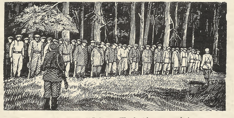
A detachement of the U.P.A. — Woodcut by a comrade in arms.

The constant changes that take place in the Party and the Government of Ukraine are a sign that Moscow is always suspicious of the feelings of Ukrainian people and does not trust even its own instruments. Proof is constantly being given that governing Ukraine is no easy matter and that the