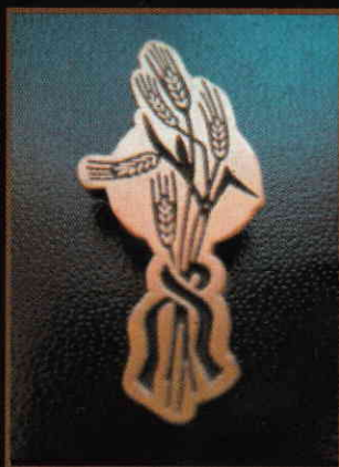
Commemorative Pin designed by Oleh Lesiuk