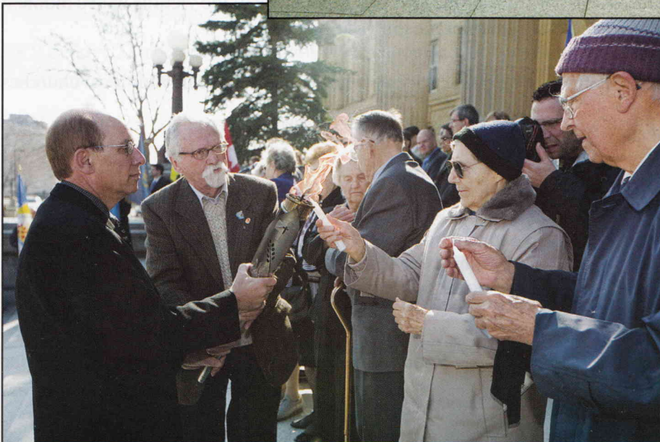
Edmonton Mayor Stephen Mandel lights the candles of Holodomor survivors at the Alberta Legislature.