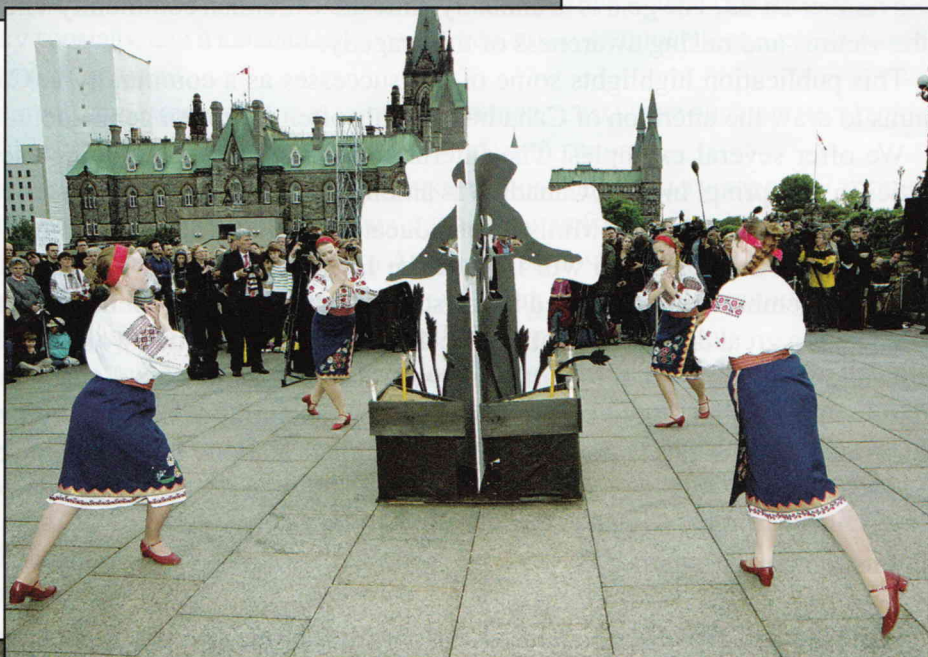
Members of the "Svitanok" dance group perform at the Holodomor Monument replica on Parliament Hill in Ottawa,