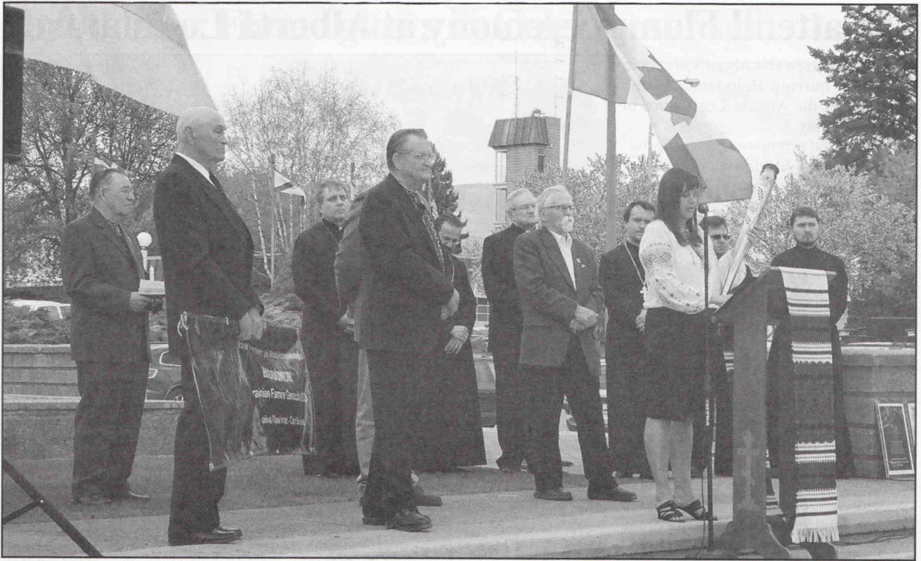
Youth representative speaks during the Vernon ceremony.