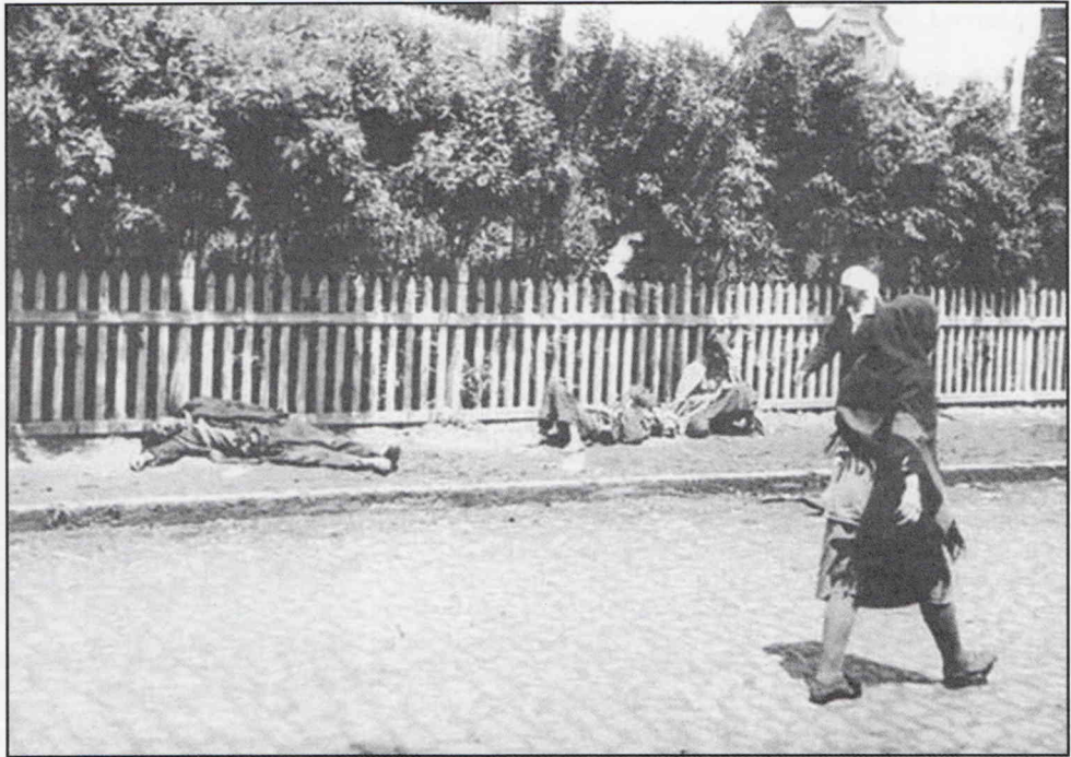
People walk past the corpses of Holodomor victims in Kharkiv in 1933. This photo, taken by Austrian, Otto Wienerberger, was included in the revised version of the Alberta textbook "Perspectives On Nationalism".

Board officials insisted that students could still learn about