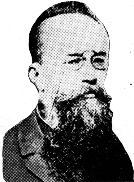
Prof. Mykhailo Hrushevsky, First President of the Ukrainian National Republic and President of the Ukrainian Central Rada in 1917-1918.

A head of a state which has existed for centuries has a considerably easier time of it, inasmuch as he enjoys the traditional prestige of the office of head of state, from which also stems smoothness of functioning of the state system. Sometimes even ordinary and quite mediocre individuals immediately acquire a halo of prestige and rec-