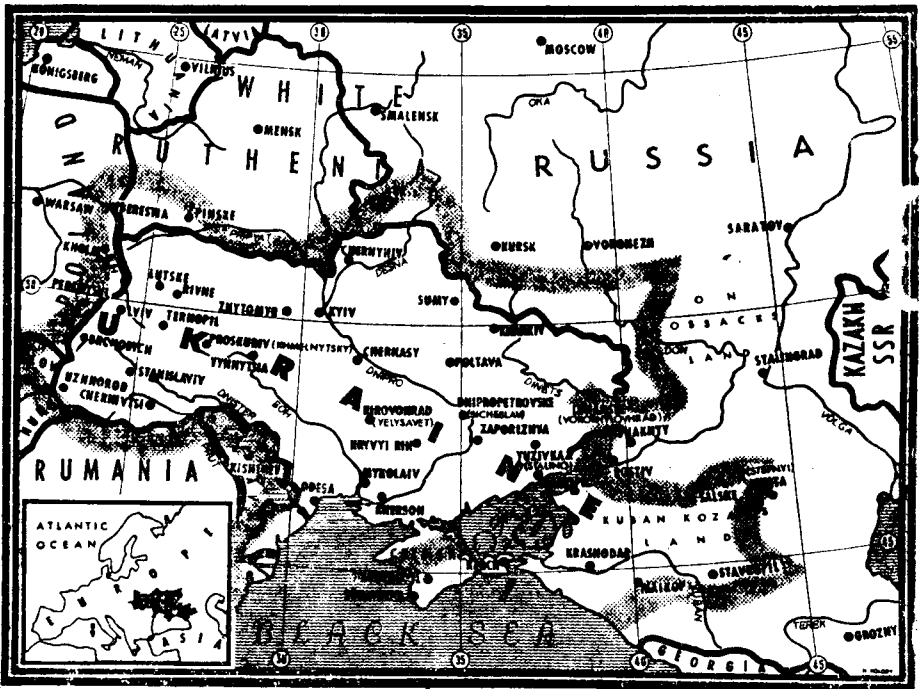
Stippled area: Ukrainian ethnographic territory