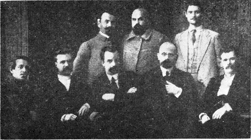
THE FIRST SECRETARIAT GENERAL OF THE UKRAINIAN CENTRAL RADA. Sitting from left to right: Simon Petlura, Sergiy Yefremov, Volodymyr Vynnychenko, Christopher Baranovsky, I. Steshenko; Standing from left to right: Boris Martos, M. Stasiuk and Pavlo Khrystiuk.

chenko, presented a draft of the Ukrainian constitution, Kerensky rejected it and issued an official ordinance instead, by which he completely disregarded the Central Rada and the Secretariat General, and in so doing, tried to retain whatever little power he had in Ukraine in his hands.