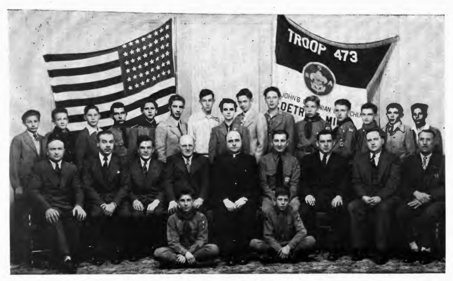
UKRAINIAN CATHOLIC BOY SCOUTS OF AMERICA OF ST. JOHN'S UKRAINIAN CATHOLIC CHURCH, DETROIT, MICH., with their Pastor, Scout Master, and Scout Committee