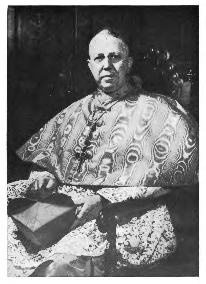
HIS EMINENCE, EDWARD CARDINAL MOONEY, Archbishop of Detroit