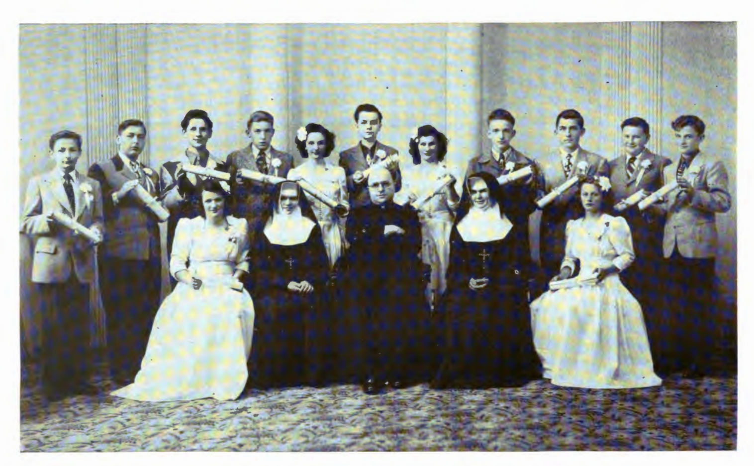
THE FIRST GRADUATING CLASS OF JUNE 2, 1946 WITH THEIR PASTOR AND SISTERS, DETROIT, MICH.