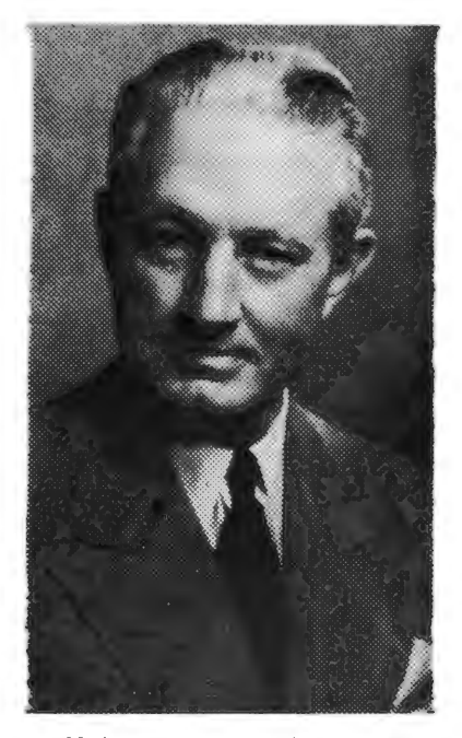
KIM SIGLER, Governor