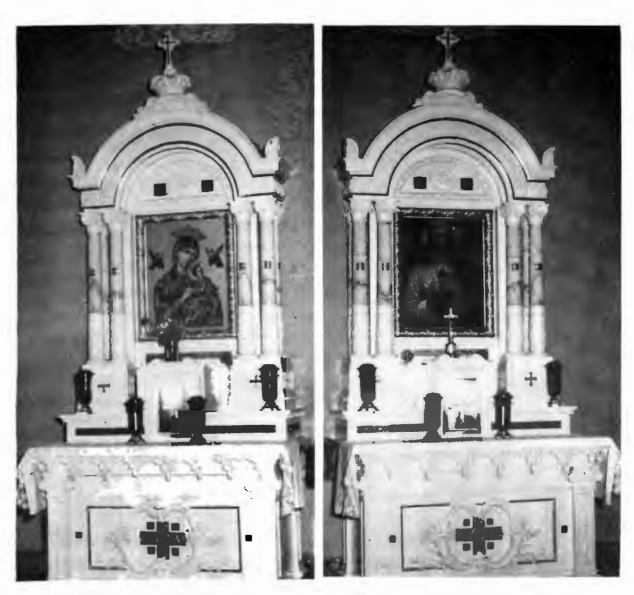
SIDE ALTARS IN ST. JOHN'S CHURCH, DETROIT, MICH.