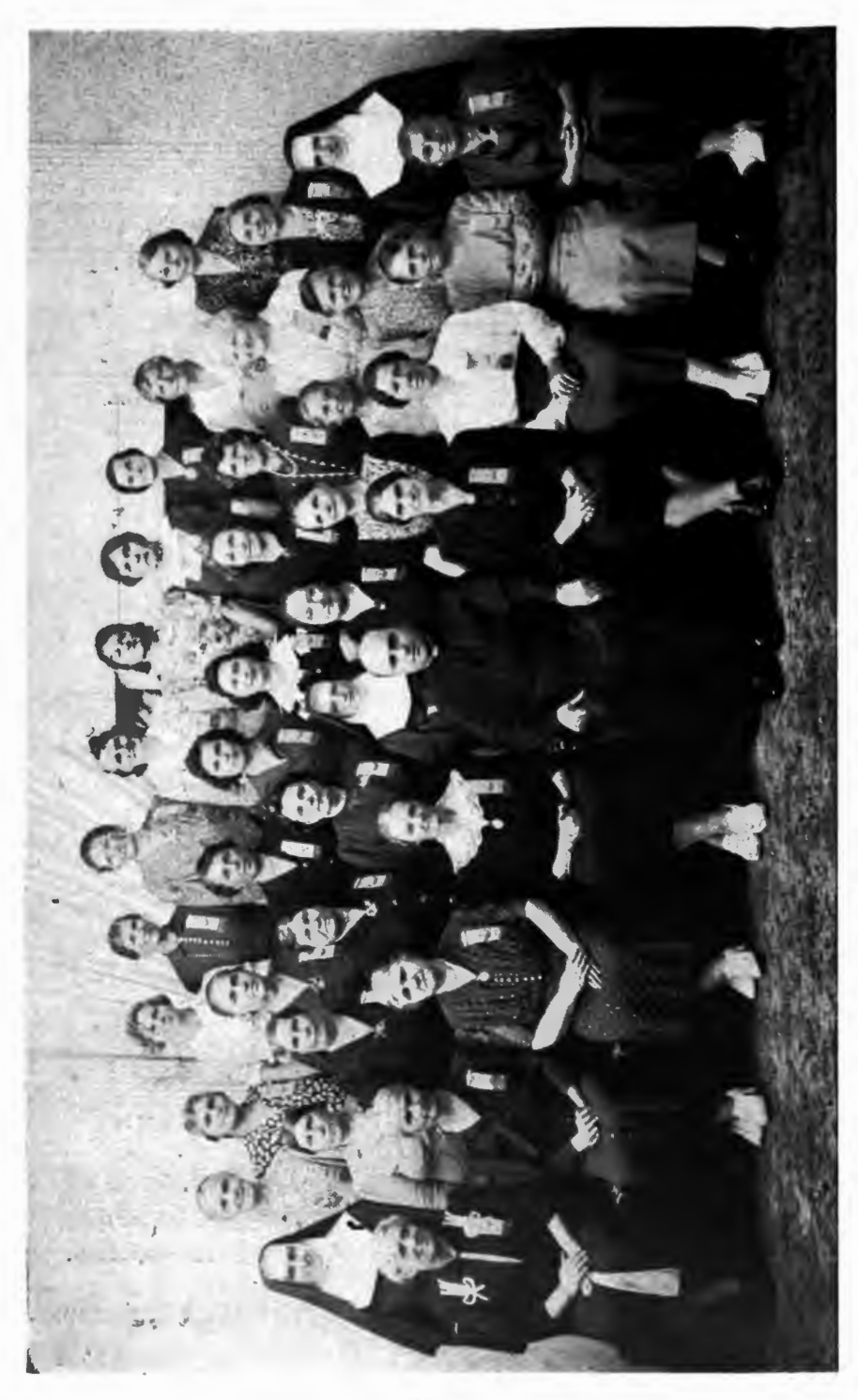
— 51 —