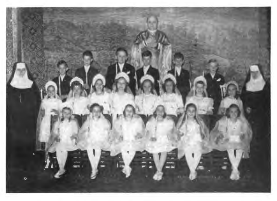
FIRST HOLY COMMUNION JUNE 1947 at St. John's Ukrainian Catholic Church. Detroit