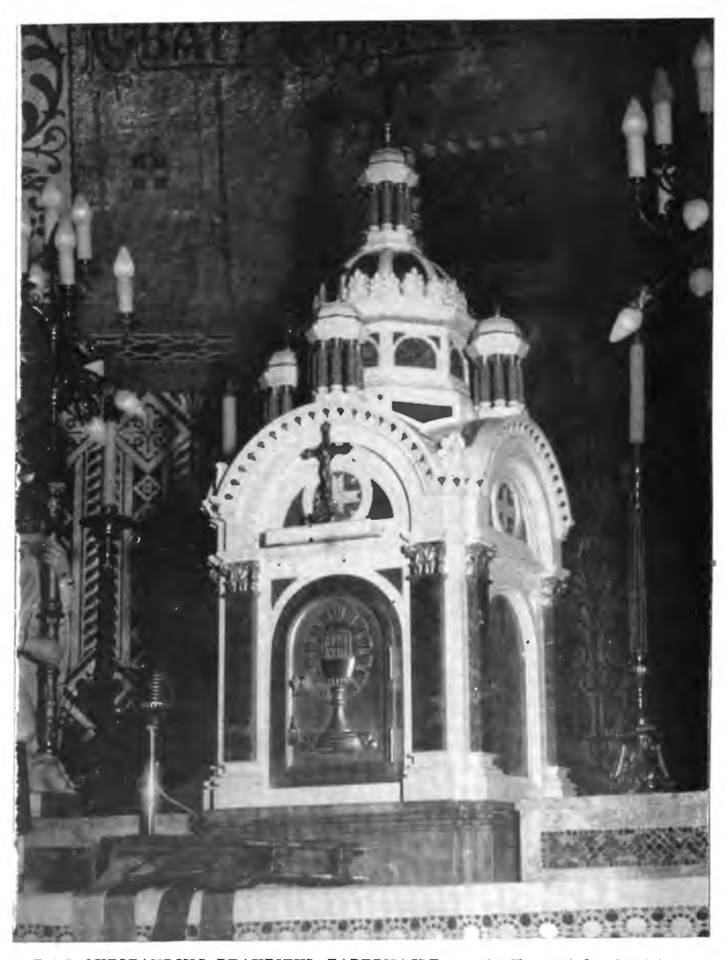
THIS OUTSTANDING BEAUTIFUL TABERNACLE — the Home of Our Lord in the Blessed Sacrament — is built in the miniature form and style of a Ukrainian Church — of white Carrara marble, Sienna Brocatelli marble, Regalieo Brazilian onyx, mosaic and gold with steel safe. This exqhisite masterpiece was created by Dapartio Studios, Chicago, 1944.