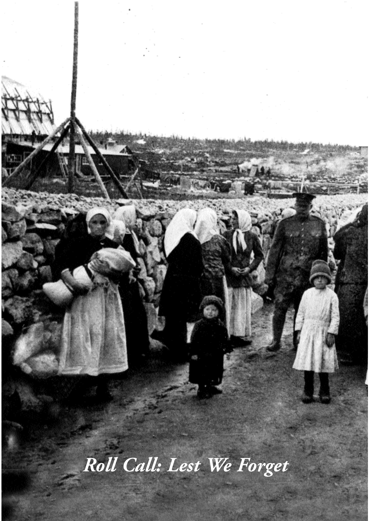
Roll Call: Lest We Forget